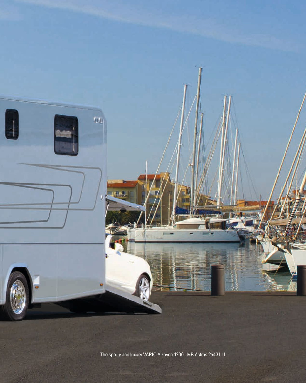
The sporty and luxury VARIO Alkoven 1200 - MB Actros 2543 LLL